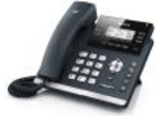
Yealink T4 series